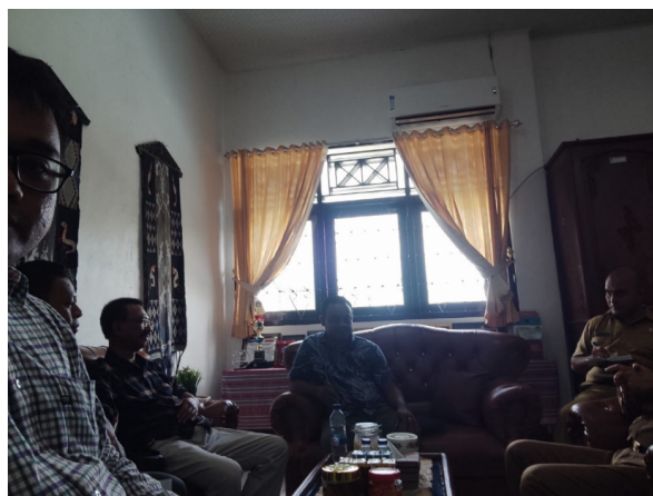
Figure 2 Discussion and Cooperation with the East Nusa Tenggara Provincial Tourism Office